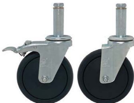
WR-00CO Shown with and without brake Sold as a set of 4 casters, 2 with brake