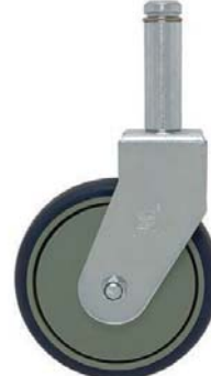
WR-RG Requires Tie Bar (See chart pg. 147)