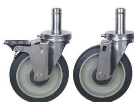
WR-00HS Shown with and without brake Sold as a set of 4 casters, 2 with brake