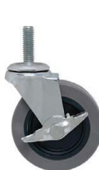
WR-3 Sold as a set of 4 casters, all with brake