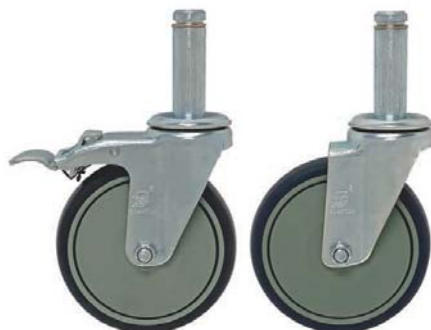
WR-00H Shown with and without brake Sold as a set of 4 casters, 2 with brake

*Requires Tie Bars for rigid alignment (See pg. 147)